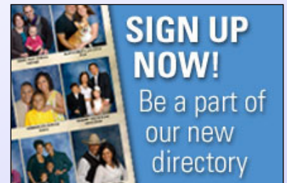
PHOTO DIRECTORY SESSION HELPERS NEEDED