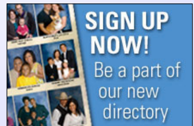
PHOTO DIRECTORY SESSION HELPERS NEEDED