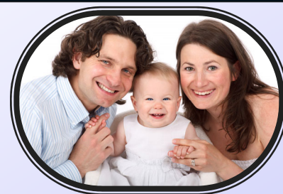
PHOTO DIRECTORY SESSION HELPERS NEEDED